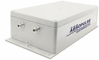
D4G version (IP66) Sealed cable glands

Enhancements to specifications are also available.