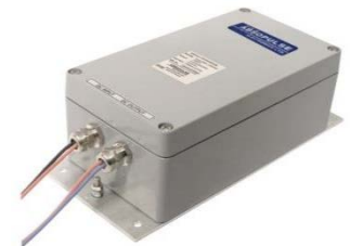
D1G version (IP66) Sealed cable glands.