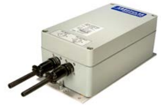
D1M version (IP66) Sealed circular connectors

Enhancements to specifications are also available.