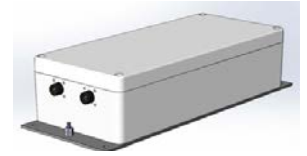
D3C version (IP66) Sealed circular connectors

Enhancements to specifications are also available.