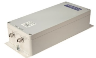
D3G version (IP66) Sealed cable glands